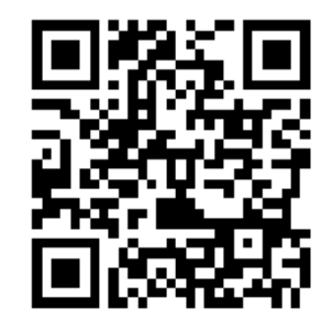
Figure 2: QR code for My homepage