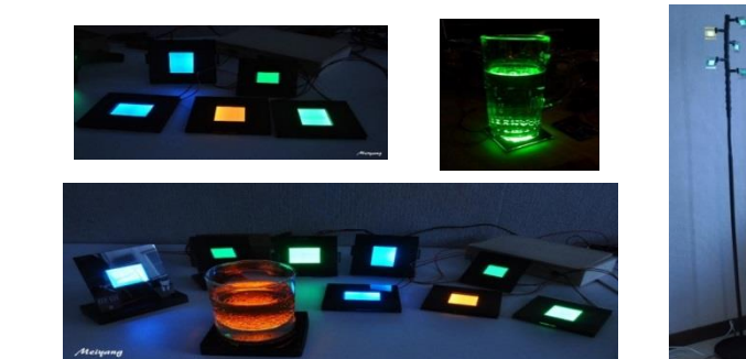
Figure 4: OLED prototypes